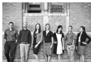
The Culture Project Texas Missionaries

February 27, 2015 (Fri), 6:30 pm–8:00 pm at Sacred Heart Church. Open to grades 7th - 12th. Parents, pastors and educators welcome!